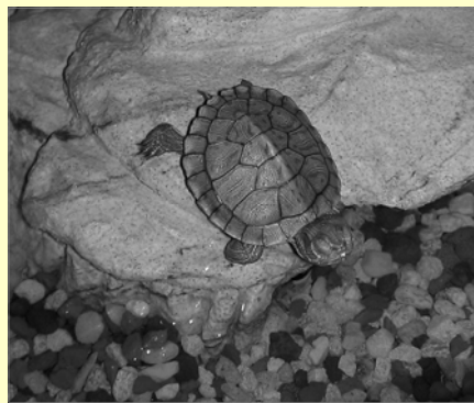
One of Christy's babies.